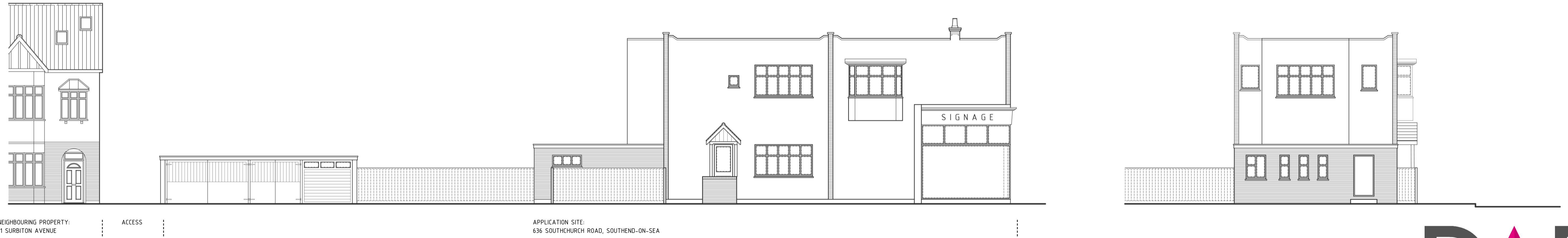
AS EXISTING: STREET-SCENE BB (ALONG SURBITON AVENUE).