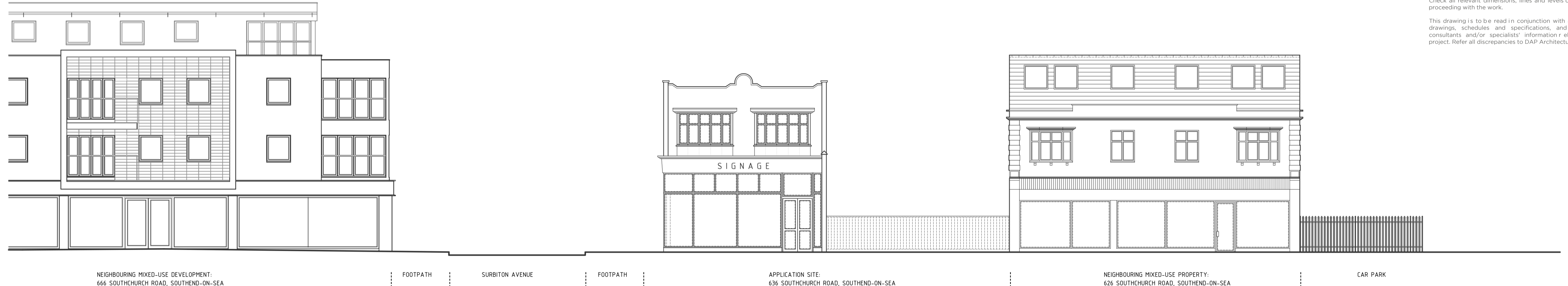
AS EXISTING: STREET-SCENE AA (ALONG SOUTHCHURCH ROAD).

GENERAL NOTES The copyright in all designs, drawings, schedules, specifications and any other documentation prepared by DAP Architecture Ltd. in relation to this project shall remain the property of DAP Architecture Ltd. and must not be reissued, loaned or copied without prior written consent. Do not scale from this drawing, use figured dimensions only. Prefer larger scale drawings. All dimensions are in millimeters (mm) unless otherwise noted. Check all relevant dimensions, lines and levels on site before proceeding with the work. This drawing is to be read in conjunction with all Architect's drawings, schedules and specifications, and all relevant consultants' and/or specialists' information relating to the project. Refer all discrepancies to DAP Architecture Ltd.